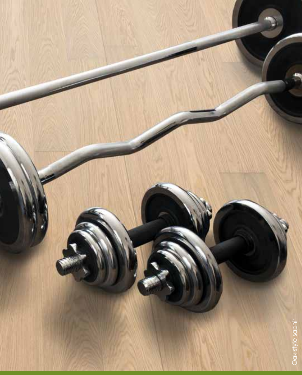
Oak style saphir

B:hard is a must everywhere, where wood flooring will experience heavy use. For Living rooms, dance schools, classrooms, offices or retail spaces. B:hard: The new classic wood floor for special occasions.