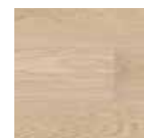
Oak style saphir